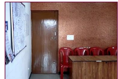
Shirur, Aurangabad, MH