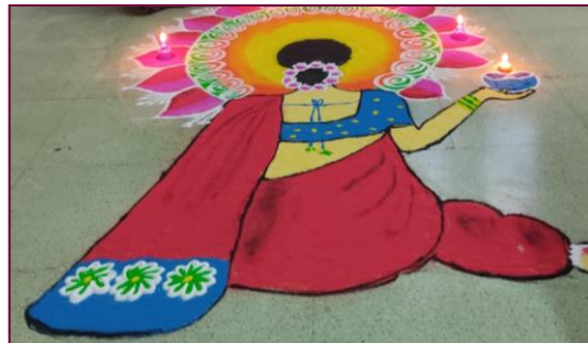
Theme Based Rangoli, Satara