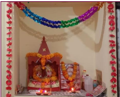
Deepawali Pooja, Ayodhya